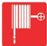
HOSE FOR FIRES