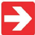
DIRECTION YOU SHOULD FOLLOW. (INDICATIVE SIGN ADDITIONAL TO THE PREVIOUS ONES)